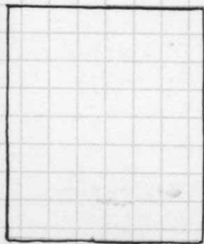
Plate One Was Evidently Made In Late 1857, or 1858, But No Stamps Were Issued From It Until 1860.