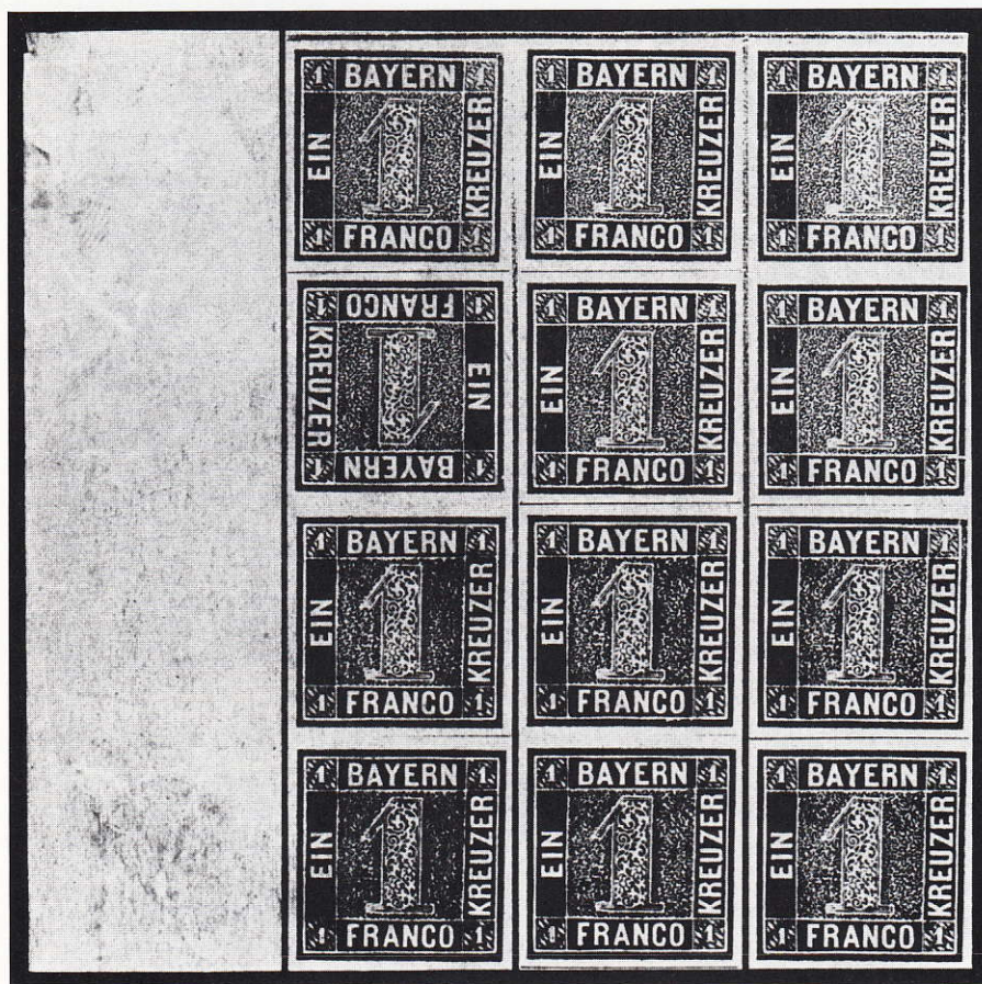
Figure 2. Ferrari-Lichtenstein tête-bêche, with PF certificate No. 235,000.

Soon after the appearance of the 1 kreuzer black, forgers started to produce copies, forcing the Bavarian Postal Department to use special paper into which a silk thread was introduced. The thread was used in the printing of