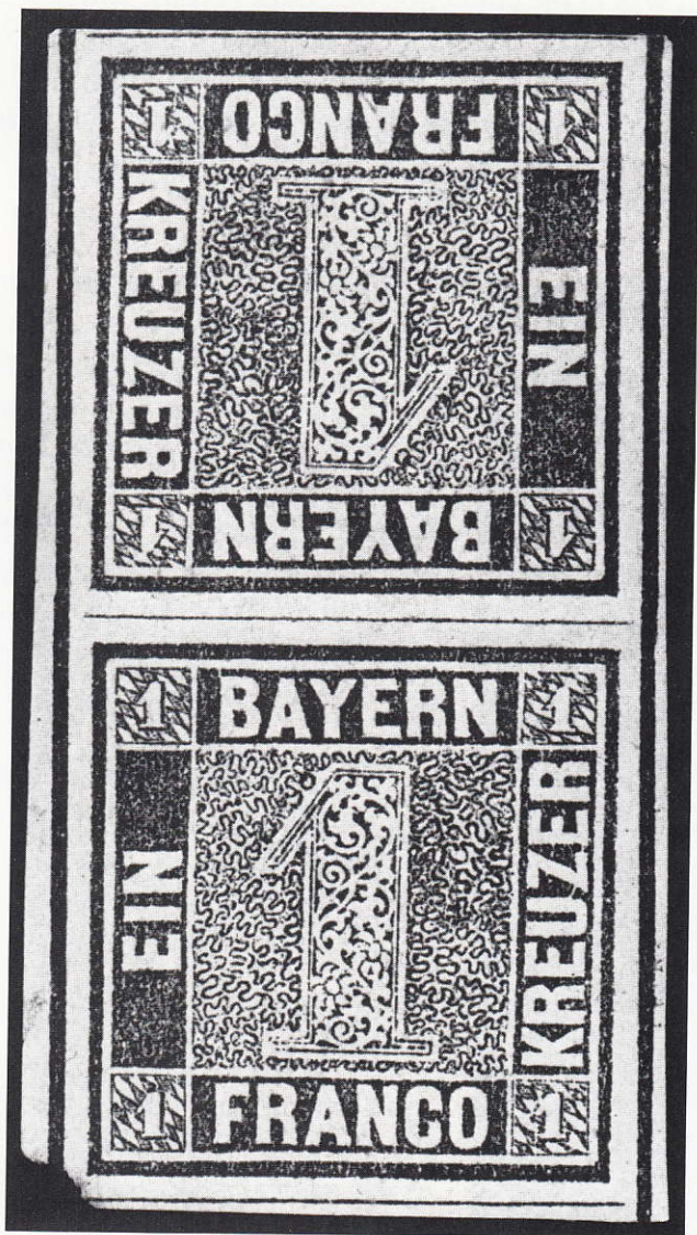
Figure 3. Sperati tête-bêche forgery showing characteristic flaws.

According to the monumental work on Sperati forgeries printed by the British Philatelic Association in 1955, Sperati used type C to produce copies of the tête-bêche and commonly sold them in London prior to 1940. He also produced vertical strips as well as horizontal pairs. These forgeries can be detected by a line joining the letters "U", "Z" and "E" of "KREUZER" and a hook-shaped flaw touching the top left of the letter "B" of "BAYERN." These characteristics (see The Philatelic Foundation's reference copy in Figure 3) are easily detectable when known. Of course, the three original copies of the famous Bavaria 1 kreuzer black tête-bêche do not have these flaws. ♦