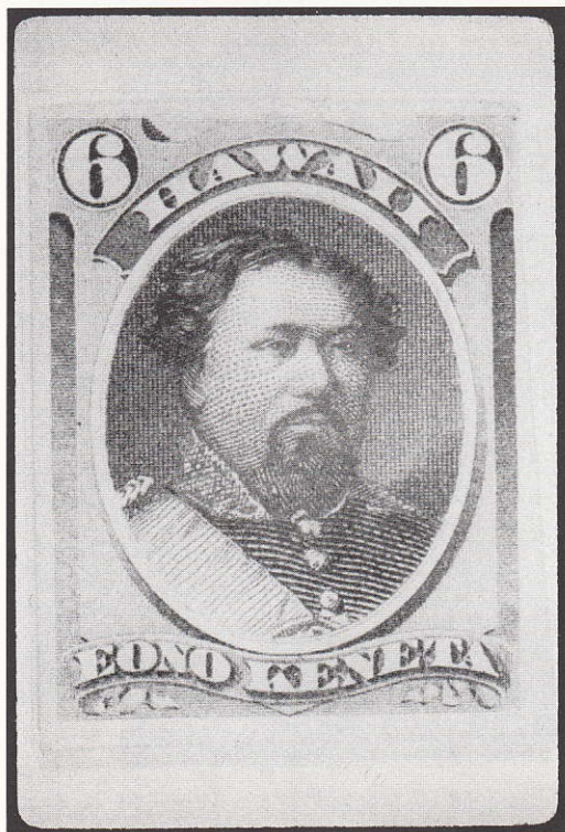
Figure 4a (Left). A genuine single copy of the 6¢ green issue imperforate variety, position 5 from the sheet. Bishop Museum Collection.

Both the Bishop Museum copy and the Advertiser pair are the bluish-green shade of the last National Bank Note Co. printing. Again the thickness of the paper differs from that of the India proofs. The most obvious difference between the imperforate variety and the proofs is the obvious plate wear evidenced by the imperforate variety. ( To be continued next issue. )