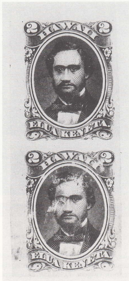
Figure 2. A genuine pair of the 2c vermilion issue imperforate variety.