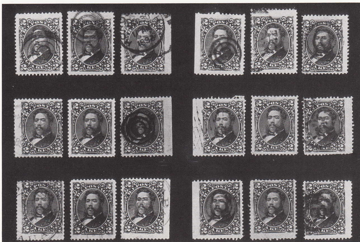
Figure 1. A partial sheet reconstruction of the 2c carmine rose issue. Both left and right panes are represented. Shown is the wide placement of the perforation combs at the sheet edges and the wide straight edges of LAYOUT V.

A scan of the Scott Catalogue suggests that regularly issued US definitives before 1890, printed either by the National Bank Note Company or the American Bank Note Company, have an imperforate variety existing about one in eight instances. If this ratio should also be valid for the Hawaiian Bank Note issues before 1890, and printed by the same companies, then about three issues might be expected to have imperforate varieties. Surprisingly this is very nearly the case. At least two instances are verified in this study. The principal difference between the imperforate varieties may be that the US imperforate stamps were recognized as collectable, hence they exist primarily unused and often in pairs. Thus identification is greatly facilitated. In Hawaii (with one exception) there was little concern regarding missing perforations. The imperforate sheets were distributed to post offices and the stamps incuriously used for postal purposes. Thus identification of imperforate Hawaiian issues can lead to many a headache for philatelists. Few pairs exist and one must look for and study used single copies. These invariably prove to be stamps that have had the perforations trimmed away.