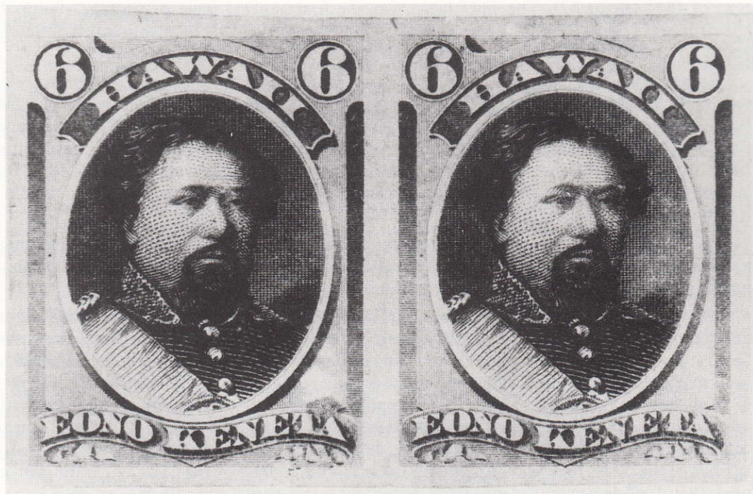
Figure 4b (Bottom). A genuine pair of the 6¢ green issue imperforate variety.