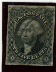
12¢ Black, Perforated with all perforations timmed away and rebacked.