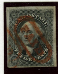
12¢ Black Manuscript cancellation removed and counterfeit cancellation added. P F C # 212,629