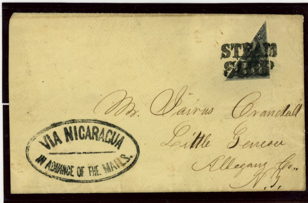
12¢ Black, Diagonal Bisect, tied by counterfeit New York STEAM/SHIP marking to cover with counterfeit VIA NICARAGUA marking at bottom left of cover.