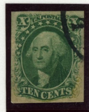
10¢ Green, Type V Bottom margin repaired and painted in to resemble the scarce Type IV.