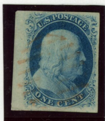
1¢ Blue, Type II Outer lines at top and bottom scraped away to resemble the Type III.