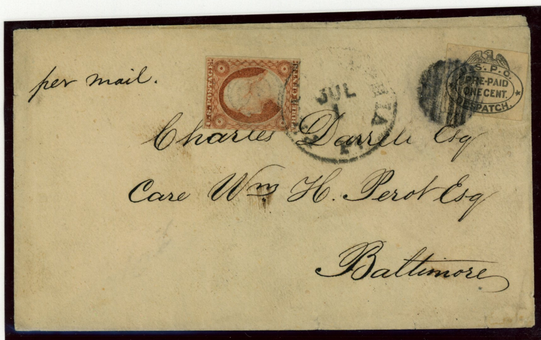
3¢ Dull Red tied by Philadelphia, Pa. postmark to cover with counterfeit Carrier stamp at top right, tied by fraudulent grid cancellation.