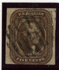
5¢ Brown, Type II with all perforations trimmed away to resemble the imperforate 5¢, Type I (Scott # 12)