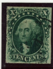
10¢ Green, Type I Perforated stamp with all perforations trimmed away to resemble imperf.