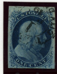
1¢ Blue, Type V Top row example from plate 5 with all perforations trimmed away to resemble Type III.