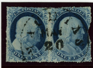
1¢ Blue, Type IV, Horizontal pair with counterfeit rouletting.