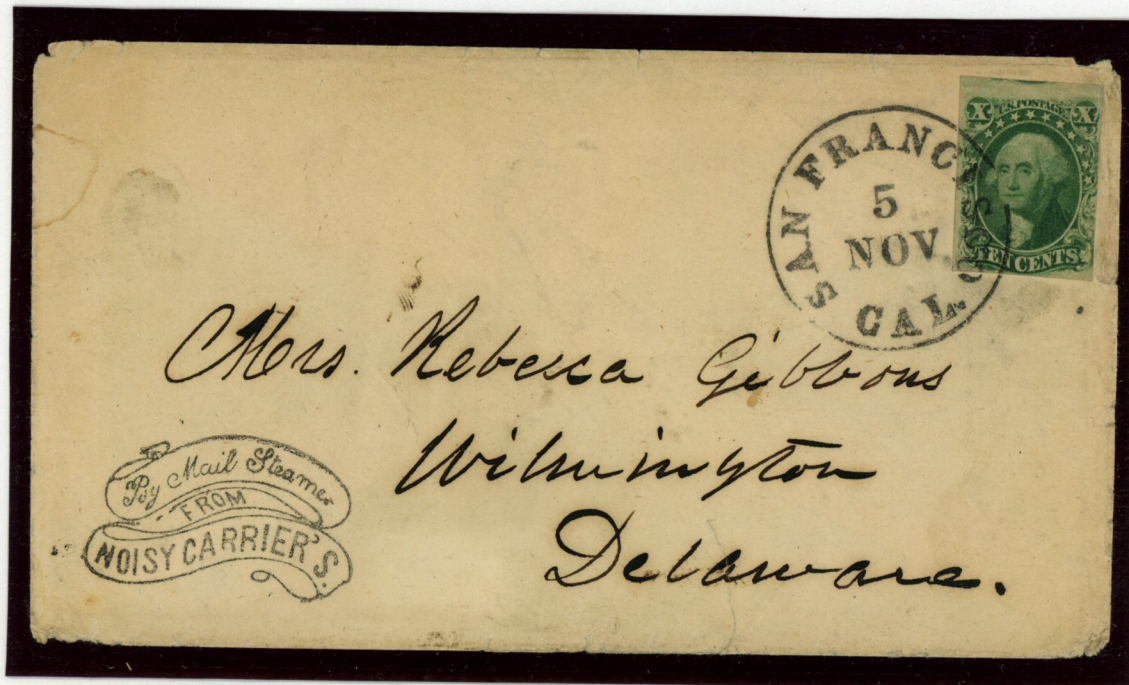
10¢ Green, Type III, tied by San Francisco postmark to cover with counterfeit Noisy Carrier marking at bottom left of cover.