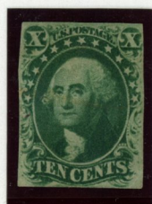
10¢ Green, Type V Perforated stamp with all perforations trimmed away to resemble Type III.