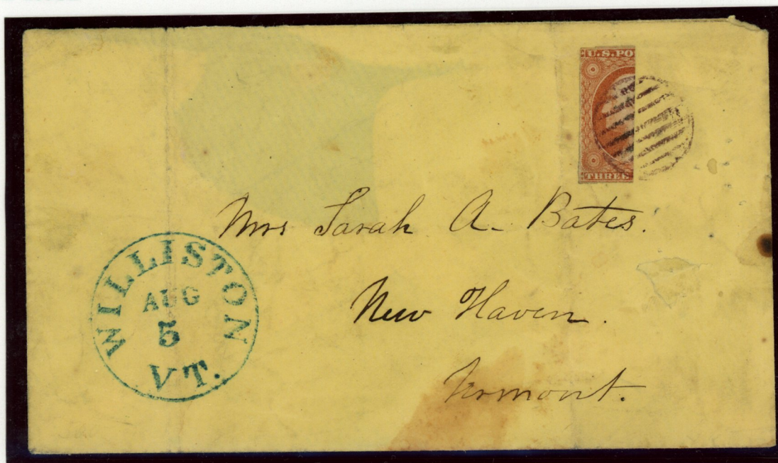
3¢ Dull Red, fraudulent vertical bisect, tied by counterfeit cancellation.