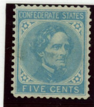
5¢ Blue, De La Rue Fraudulently Perforated 12.5