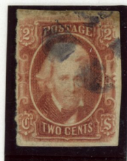
2¢ Brown Red Counterfeit Cork Cancellation