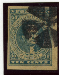
Springfield Facsimile Fraudulent Cancellation