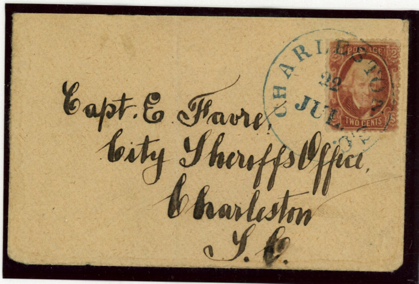
2¢ Brown Red Fraudulent Perforations