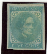
5¢ Blue, De La Rue New York Counterfeit Greenish Shade