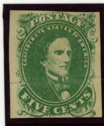
Birmingham Counterfeit Incorrect lower ornaments