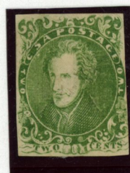
Birmingham Counterfeit No Periods after "CSA"