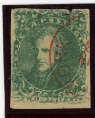
Genuine Stamp Counterfeit Cancellation