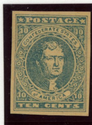
Springfield Facsimile Slight Differences