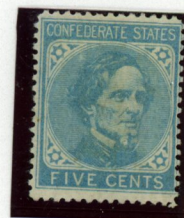
5¢ Blue, Archer & Daly Fraudulently Perforated 14