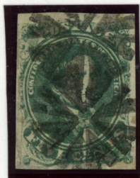
Genuine Stamp Non-Contemporary Cancellation