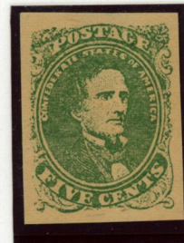
Springfield Facsimile Slight Differences